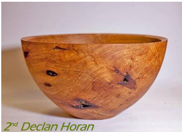
2 nd Declan Horan