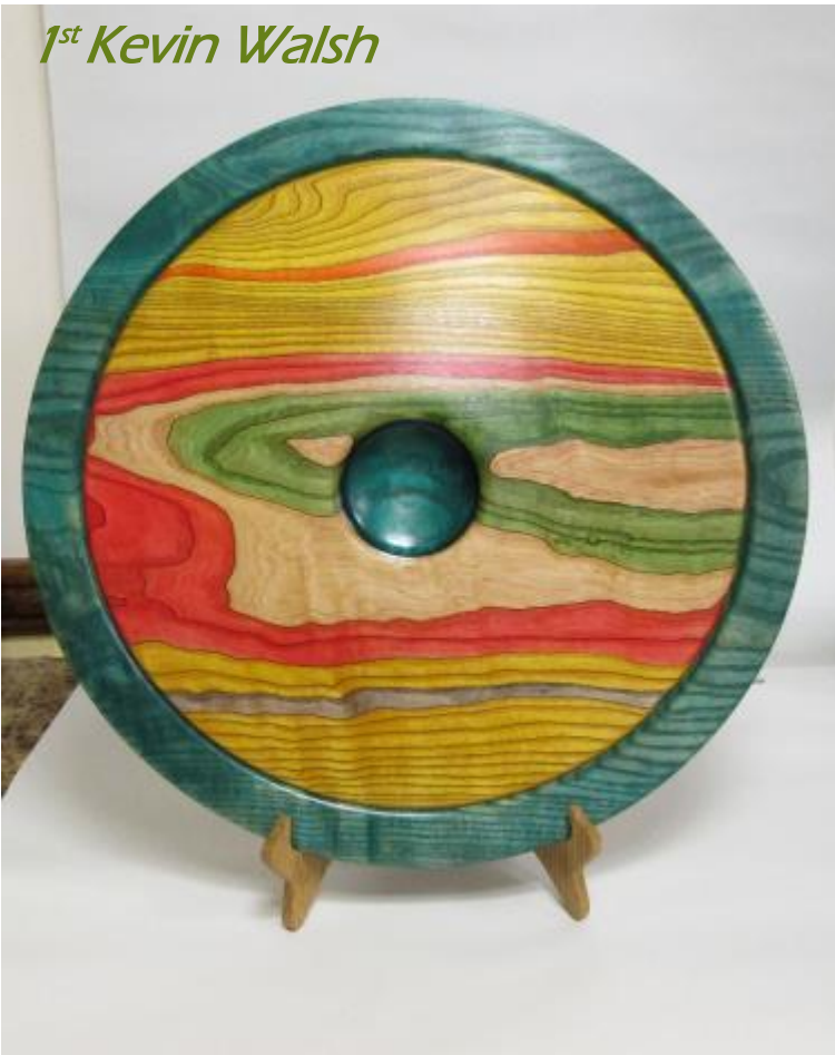
1 st Kevin Walsh