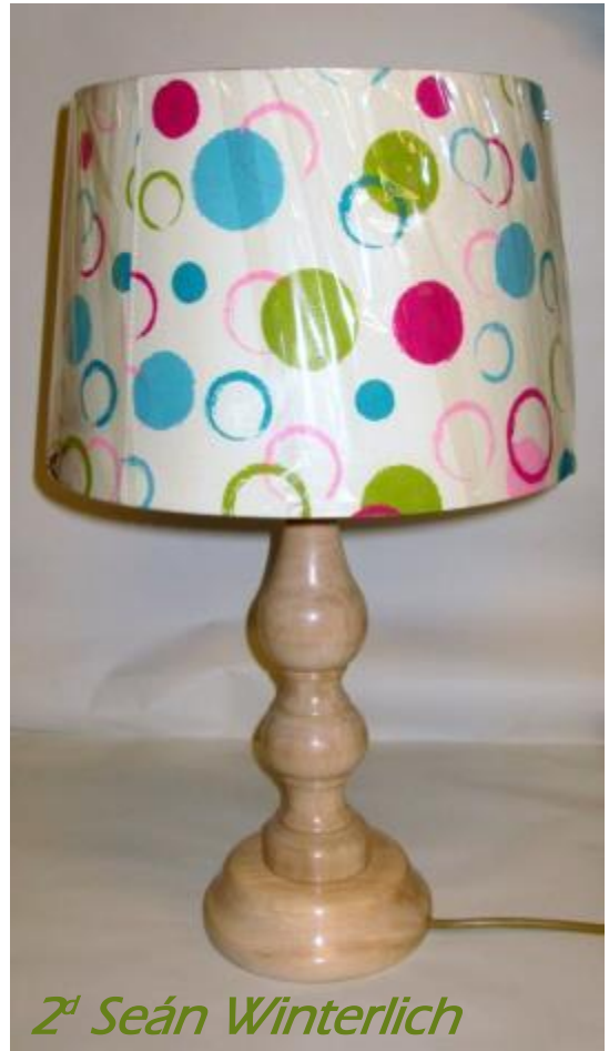
2 d Seán Winterlich